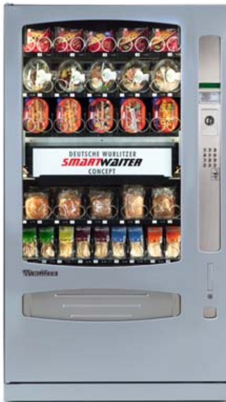
Wurlitzer 1000 – Food version with Smart Waiter

Both temperature levels and VarioTemp are possible from the same cooling unit. Both models are also available without cooling unit for vending of non-food products.