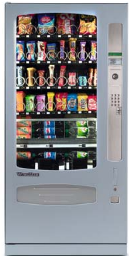
Wurlitzer 850 with special module for cans and PET bottles